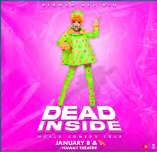
BIANCA DEL RIO DEAD INSIDE JANUARY 8 & 9, 2025