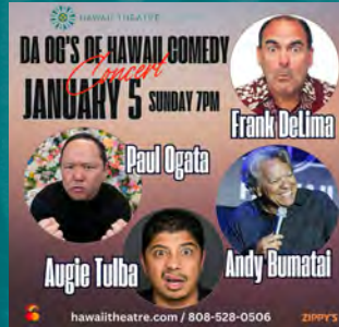
DA OG'S OF HAWAII COMEDY HANA HOU SHOW JANUARY 5, 2025