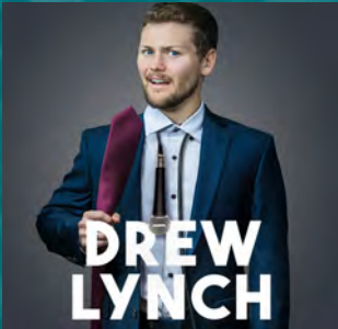
DREW LYNCH DECEMBER 31, 2024