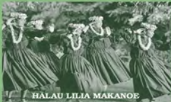
HALAU LILIA MAKANOE