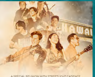
A SPECIAL REUNION WITH STREETLIGHT CADENCE THE HAWAII THEATRE FRIDAY, DECEMBER 13

KUPUNA MOVIE EVENINGS - "WHITE CHRISTMAS" (1954) DECEMBER 9, 2024