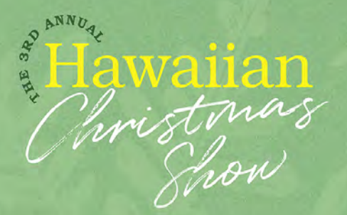
Dec 21, 2024 Honolulu, HI Doors 6:00PM Show 7:00PM